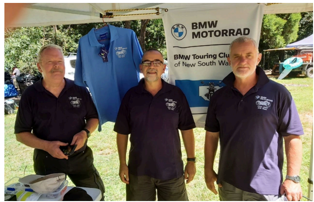
The Presidents BMWOCSA, BMWTCNSW and yours sporting Navy at the 2023 Karuah River Rally.

Shirts will be ordered in May for delivery ~6 weeks later and as a one off or so our South Aussie Club says.